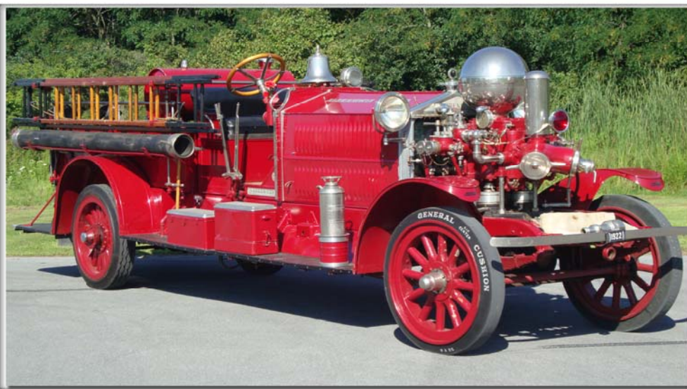
Ahrens Fox, Registration 935, Model N-S-4, Alexandria Bay, New York, Delivery Date 12-2-22

others, there was an excursion to Turning Stone Casino. The "mini muster" and National Membership Meeting were held later that Friday; there were 34 Chapters represented with 253 members present. On Saturday, there was a parade through Liverpool to the muster site. That evening at 7:00 PM, the National Banquet was held at the host hotel, the Holiday Inn.