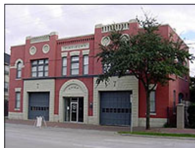
Details about the Texas Fire Museum at old Station No. 7 can be found on TexasFireMuseum.org .

ing pull-box to feel the thrill of receiving a fire call, a prized collection of fire service artifacts, and other special exhibits. Hours are Tues-Sat 10-4. Admission is $3 for adults and $2 for children. Ya'll come on by and enjoy Houston hospitality!