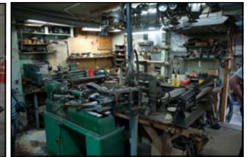
Left: Photo of Ken's Seagrave restoration. Right: One of the many rooms at Ken's Hand-in-Hand shop. How many items can you identify in the photo? See TGCC website gallery for additional photos.