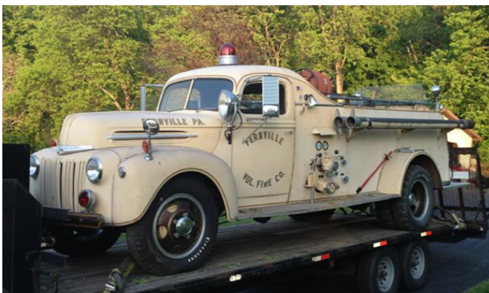
1946 Ford Howe ex-Fernville PA VFD. Housed at Cajun Fire Museum Breaux Bridge LA. 500 GPM pump with 298 CUID V-8 Flathead. 13,000 odometer miles