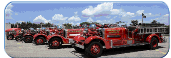
Cover Page and Ahrens Fox Artwork by The Fire Museum of Maryland