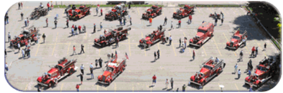
The greatest show since 1982 in Cincinnati. A wide variety of 17 Foxes -- different styles, original paint and restorations -- made for a wonderful show!

The day finished with yet another walk through of this fine museum. One of the highlights of this facility is a working dispatch office and a variety of old alarm pull boxes staged around the facility. If you pull any one of them they ring into the dispatch center, the paper tape printer comes to life and punched out the box code. Museum volunteers are on hand to answer questions and provide interesting facts about the equipment. I highly recommend this museum; you can easily spend a whole day there, and they offer a discount to firefighters. You can check them out on the internet at http://www.firemuseummd.org/ . Perhaps even plan a visit to coincide with one of their special events.