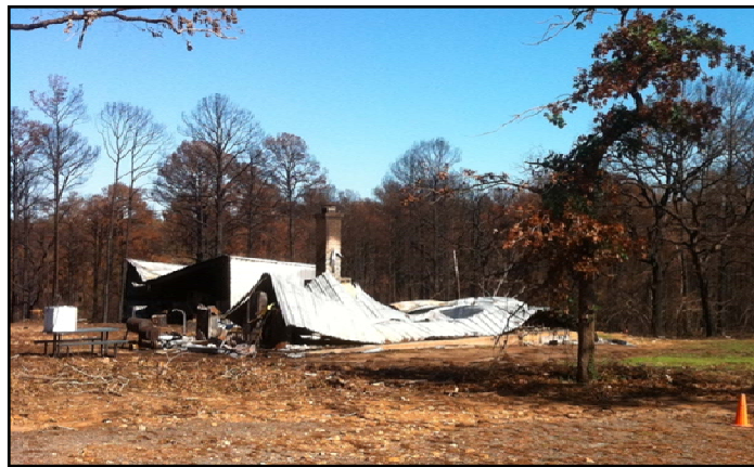
Texas Forest Service Headquarters building just north of Heart of the Pines VFD Station 1