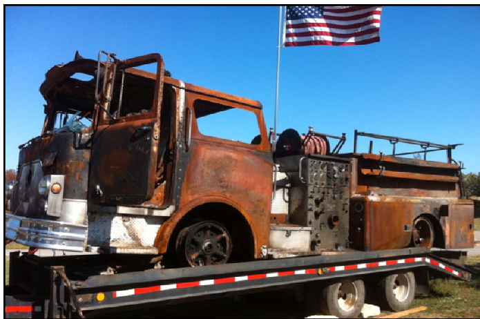
Heart of the Pines VFD engine lost during the wild fires

Fire Departments also donated a new brush truck, new firefighter uniforms, and boots to a department hit hard by the wildfire. Hopefully this will be just the beginning to help the Heart of the Pines Volunteer Fire Department get back on their feet.