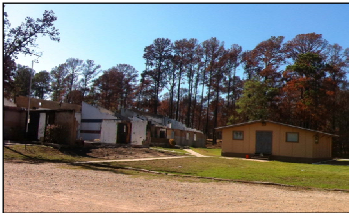
Huge masonry church totally burned out next to a plywood outbuilding that survived unscathed. Such sights are common. Go figure!